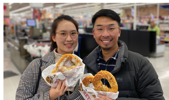
Americans can eat *at* the grocery store?

Meanwhile, Auckland as a city was locked down, twice. These were the things “in the balance,” while adjusting to student life at a