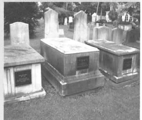
The tomb of Charles Hodge

In response to the reverence, affection, and gratitude expressed on that occasion, Hodge said, "A man is to be commiserated who is called upon to attempt the impossible. The certainty of failure does not free him from the necessity of the effort. It is impossible that I should make you understand the feelings which swell my heart almost to bursting." The much-loved and deeply-loving Hodge died on June 19, 1878.