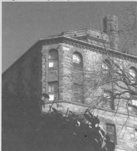
Hodge Hall-Princeton Theological Seminary

In 1846, Hodge was elected moderator when the Presbyterian Church met at Tenth Presbyterian Church in Philadelphia. He was a vital churchman all his life, active in the Board of Home and Foreign Missions and Education/Publications as well as special committees (e.g., revising the Book of Discipline). While he did not always attend General Assembly, he generally wrote a lengthy review of its actions, relying on trusted persons in attendance. These reports were published in the Princeton Review and serve as an excellent index of Hodge's views on important ecclesiastical issues of the day. Hodge's views were widely sought and deeply respected in his time.