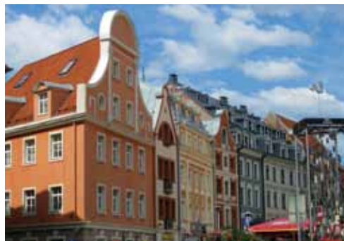
Buildings in Old Riga