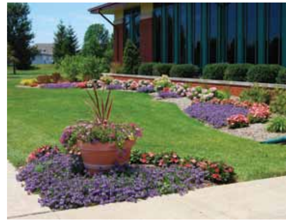
Mid-America's new landscaping. Thanks to Woldhuis Farms of Grant Park, IL.

Recent visitors to the campus of Mid-America Reformed Seminary have enjoyed the new landscaping around the front of the building. After occupying the building for more than sixteen years, the shrubbery and flowers were beginning to look a little tattered and worn. Now that the old has been replaced by the new, the Seminary has a fresh and inviting look, with a profusion of brightly colored annuals and flowering bushes. All of the flowers and bushes for the new landscaping were generously donated by Woldhuis Farms of Grant Park, Illinois.